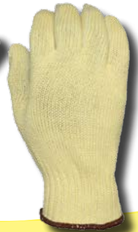
MATA 30-PL-PD1 MATA 30-PL-PD2