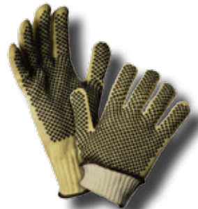
MATA 30-PL-PD1 MATA 30-PL-PD2